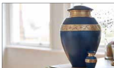
Memories - Anoka Urn