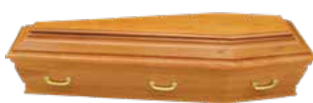
Bann European pine coffin with a satin finish.