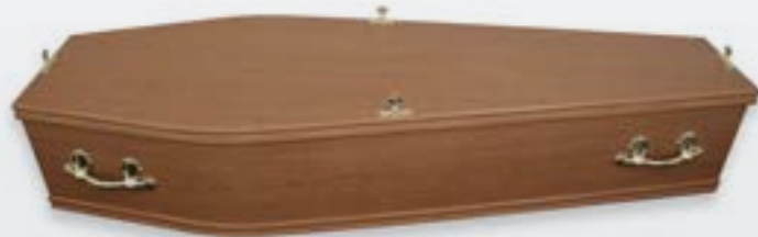
Wood effect coffin featuring flat lid and sides

We are here for you 24 hours a day 365 days a year