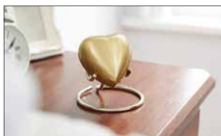
Memories - Heart Shaped Keepsake