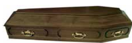
Derg African ayous wood with a matt finish.